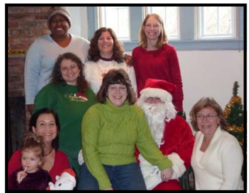
In December, 2010 we held our Annual Breakfast with Santa. We all had a really good time!